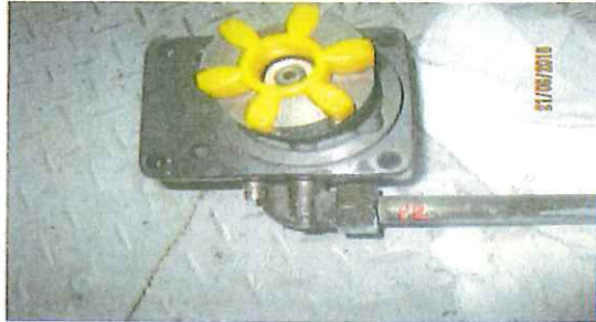
After Re-new the Spider