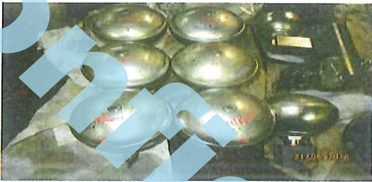
Re-new all Accumulator