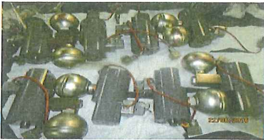
After Re-assemble the Cylinder