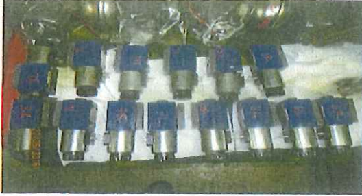
Remove and visual inspect the