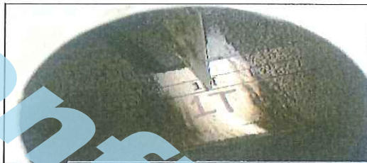
Check the Rotary Encoder - Mounting condition and coupling condition