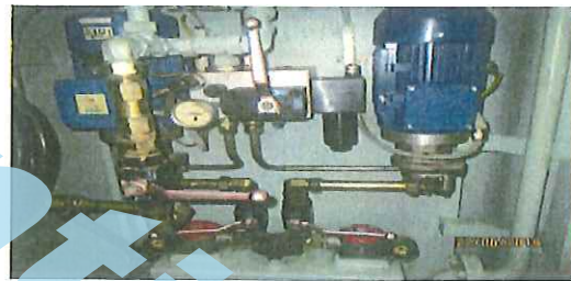
Motor are overhaul by vessel engineer