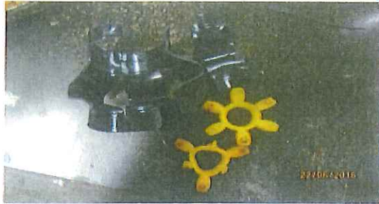
Found 1 Spider Coupling broken