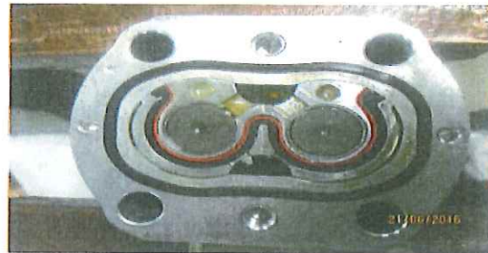
Renew Seals for Gear Pumps