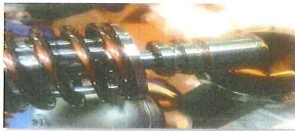
Condition of the Piston