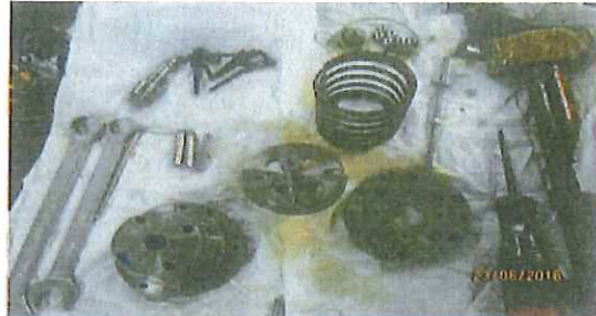
Dismantling the Lubricator Units